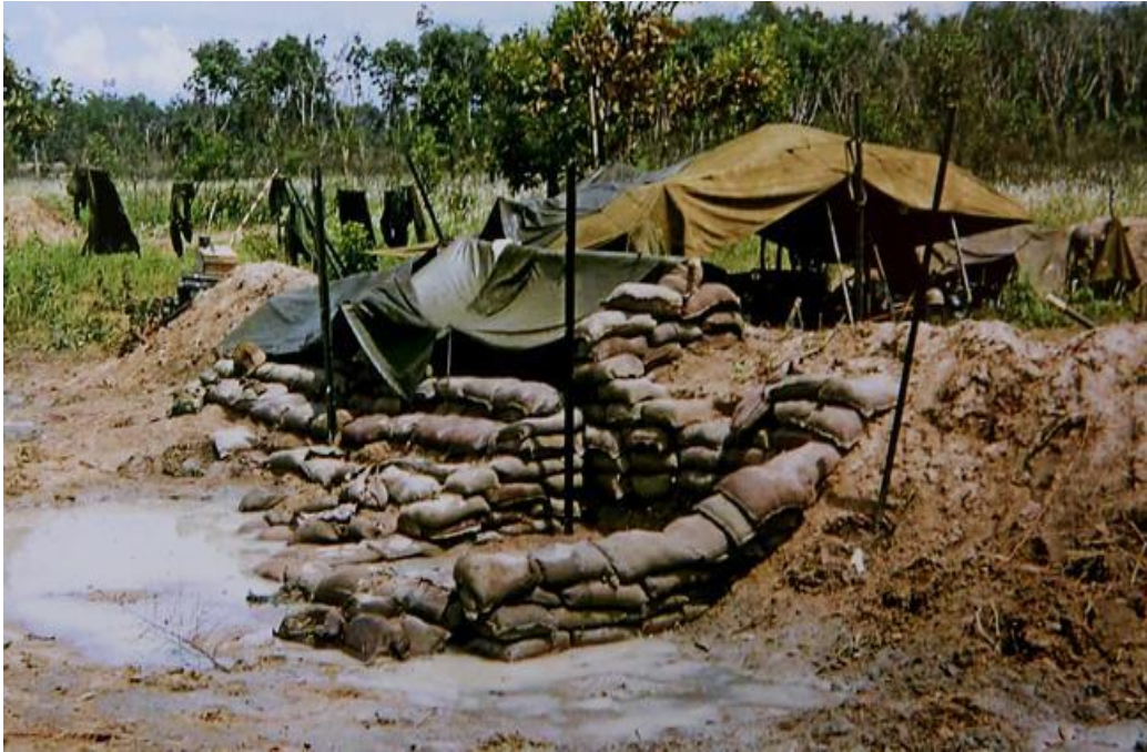
Gun pits ... at Fire Support Base "Coral" in Vietnam in 1968

Australian, New Zealand and United States forces were involved in a series of actions between May and June 1968 at Fire Support Bases Coral and Balmoral some 20 kilometres north of Bien Hoa city. Sitting astride a route used by North Vietnamese and Viet Cong forces approaching or departing Saigon and nearby Bien Hoa, the bases comprised defended positions for artillery, mortars and armoured vehicles which in turn supported infantry patrols of the area. The North Vietnamese launched several strong attacks in an attempt to drive the Australians from this important area. The Australians also initiated combat during their many patrols outside the bases. These actions, over a 25-day period, made up Australia's costliest and most protracted battle of the Vietnam War.