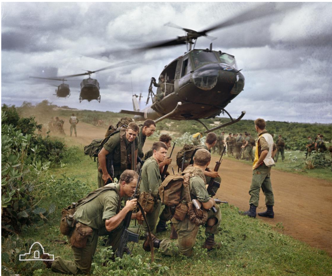
Extraction by Helicopter